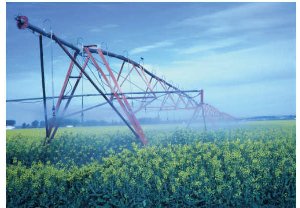
Pivot irrigation system - stock photo