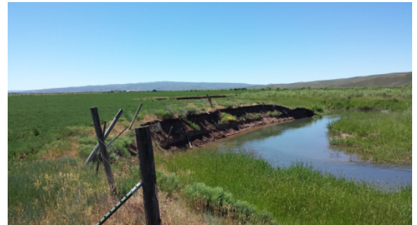
Grant Proposal