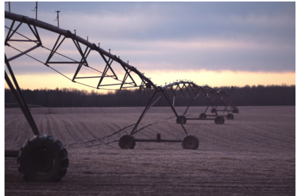
Pivot irrigation system - stock photo