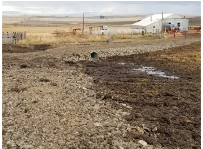
Access Road with culvert

Tracker tells stories at a broad-brush level. Individual project performance measures and expenditures should not be relied upon for complete and total accuracy and should be confirmed with a project's lead implementer. Project locations subject to confidentiality provisions under state and federal law specify the location of a local conservation district or USDA service center office.