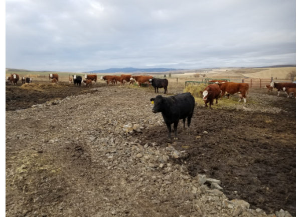
Access Road Credit: E Rowan