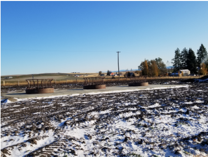
Heavy Use Feeding Pad