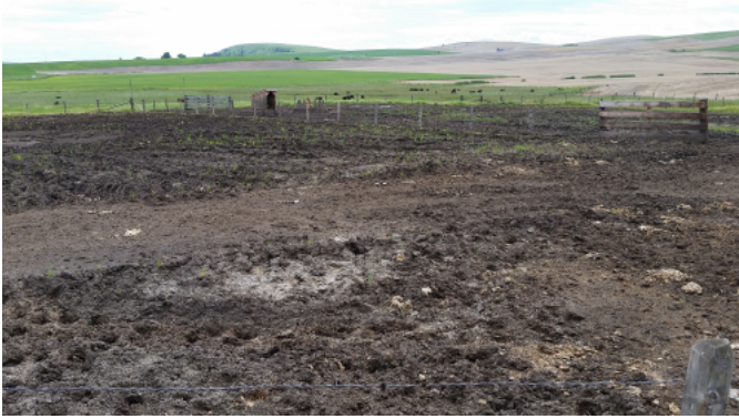
Spring Lot Credit: E Rowan