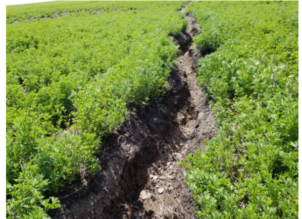
Gully erosion