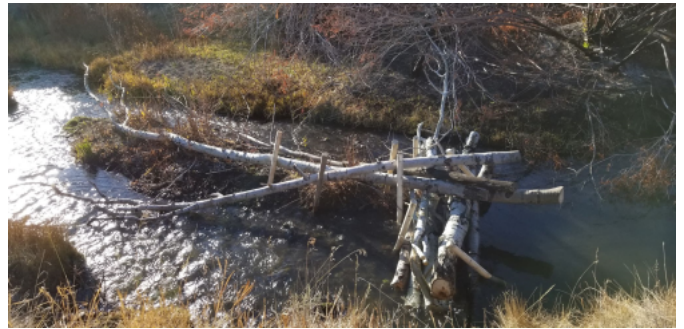
Mid-Channel Large Woody Debris

Tracker tells stories at a broad-brush level. Individual project performance measures and expenditures should not be relied upon for complete and total accuracy and should be confirmed with a project's lead implementer. Project locations subject to confidentiality provisions under state and federal law specify the location of a local conservation district or USDA service center office.