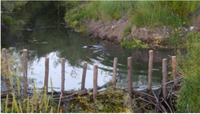
Beaver Dam Analogue