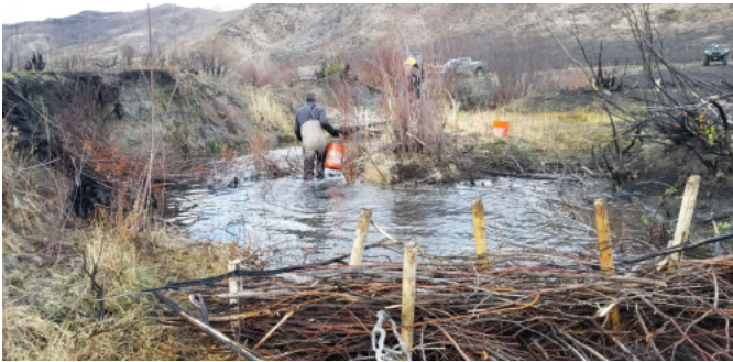
Beaver Dam Analogue-Baugh Creek Post-Fire