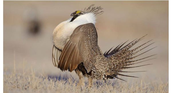
Sage Grouse

This National Fish and Wildlife Foundation (NFWF) funded grant primarily focuses on restoring lost hydrology to wet meadow, mesic, and wetland areas. This position works on restoring, enhancing, and/or protecting sagebrush steppe, maintaining/building strong collaborative partnerships, communicating about the program, and ensures a well-trained workforce exists to deliver supporting landscape scale conservation. Works with landowners, local, state, federal, and NGOs. Landscape scale improvements to these limited resources are expected to benefit from implementation across jurisdictional boundaries and are expected to have the greatest impact to sage-steppe obligates and associated species.