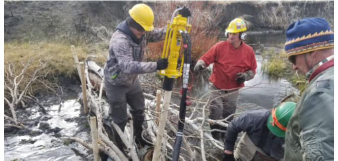
Channel Spanning Large Woody Debris