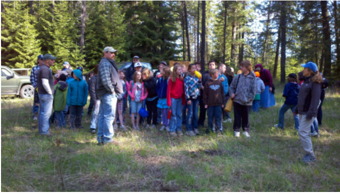
Students at the Forestry Contest.

Tracker tells stories at a broad-brush level. Individual project performance measures and expenditures should not be relied upon for complete and total accuracy and should be confirmed with a project's lead implementer. Project locations subject to confidentiality provisions under state and federal law specify the location of a local conservation district or USDA service center office.