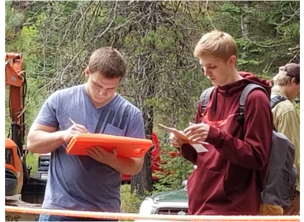
Students addressing questions posed at the soils station.