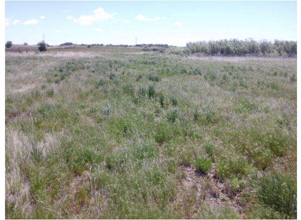
420 N Greenstrip 3.2 acres