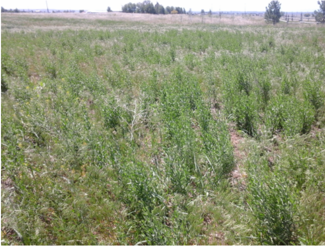
420 N Green Strip - Wet Spring

Tracker tells stories at a broad-brush level. Individual project performance measures and expenditures should not be relied upon for complete and total accuracy and should be confirmed with a project's lead implementer. Project locations subject to confidentiality provisions under state and federal law specify the location of a local conservation district or USDA service center office.