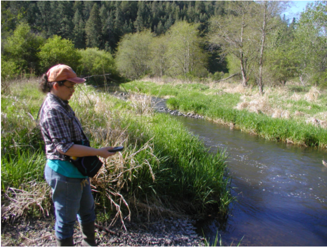
Stream Survey