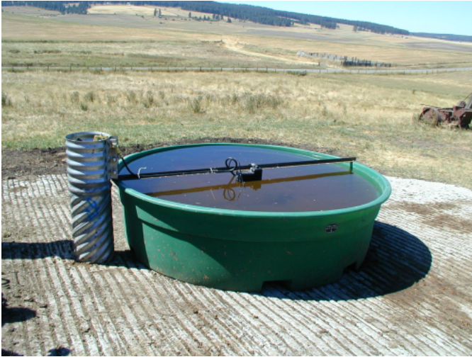
Watering Facility

Tracker tells stories at a broad-brush level. Individual project performance measures and expenditures should not be relied upon for complete and total accuracy and should be confirmed with a project's lead implementer. Project locations subject to confidentiality provisions under state and federal law specify the location of a local conservation district or USDA service center office.