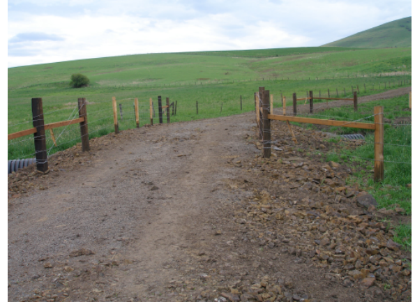
Fence and Crossing