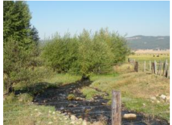
The Weiser River and Little Weiser River watersheds will benefit from WQ BMPs.