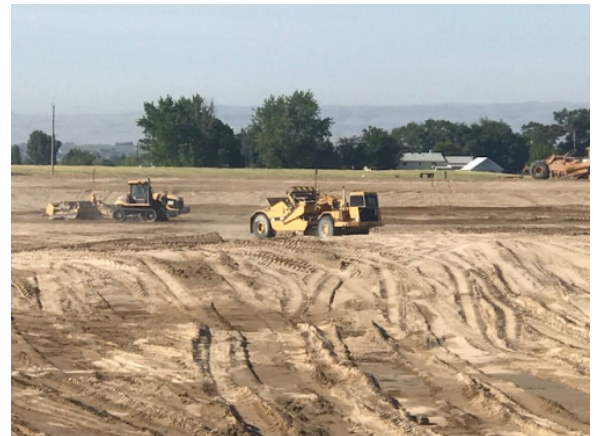
Sediment Basin Construction