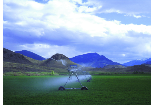
Center pivot sprinkler irrigation system