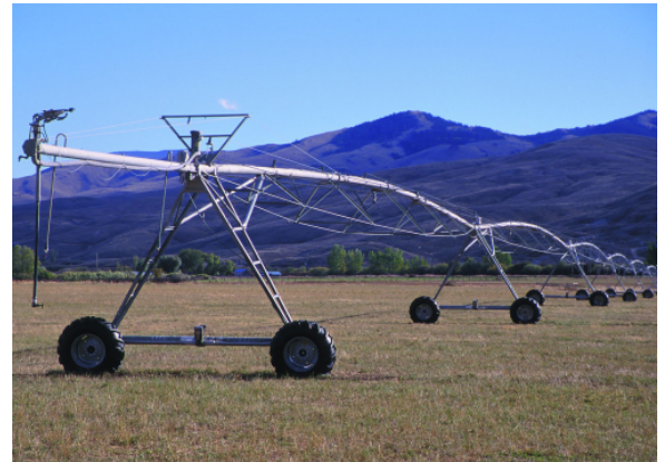
Center pivot irrigation system - stock photo