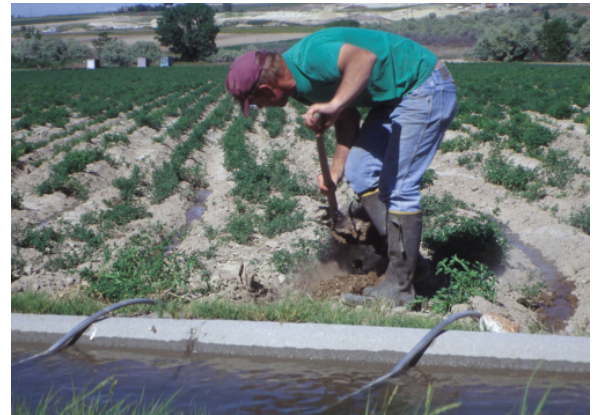
Irrigating with siphon tubes.