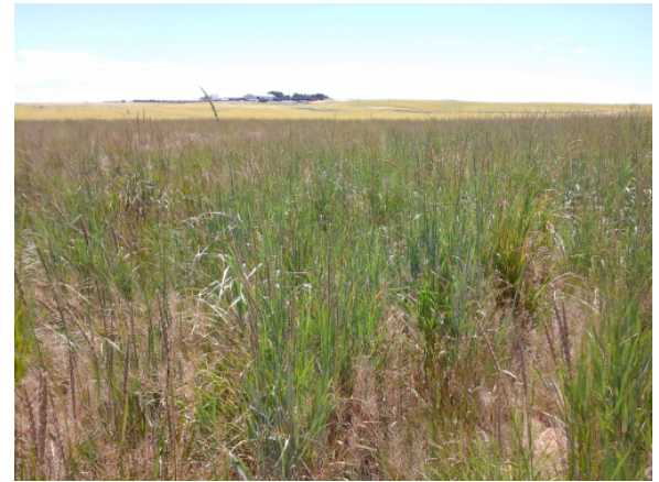
CREP field