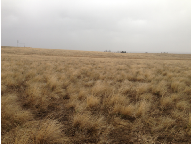
CREP field in Jerome Co.

Tracker tells stories at a broad-brush level. Individual project performance measures and expenditures should not be relied upon for complete and total accuracy and should be confirmed with a project's lead implementer. Project locations subject to confidentiality provisions under state and federal law specify the location of a local conservation district or USDA service center office.