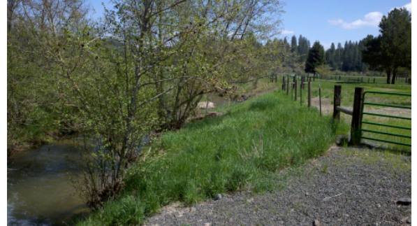
Mica Creek