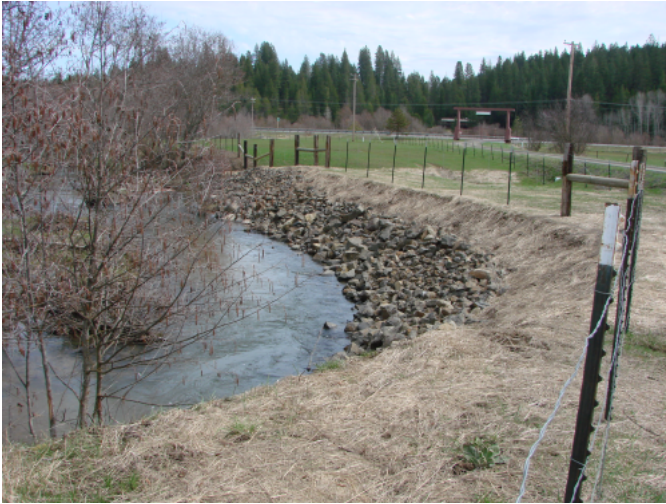
Fixing Mica Creek

Tracker tells stories at a broad-brush level. Individual project performance measures and expenditures should not be relied upon for complete and total accuracy and should be confirmed with a project's lead implementer. Project locations subject to confidentiality provisions under state and federal law specify the location of a local conservation district or USDA service center office.